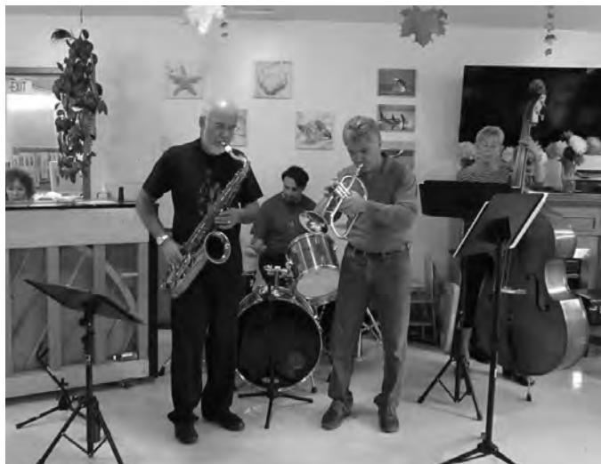
Quint Essential music group