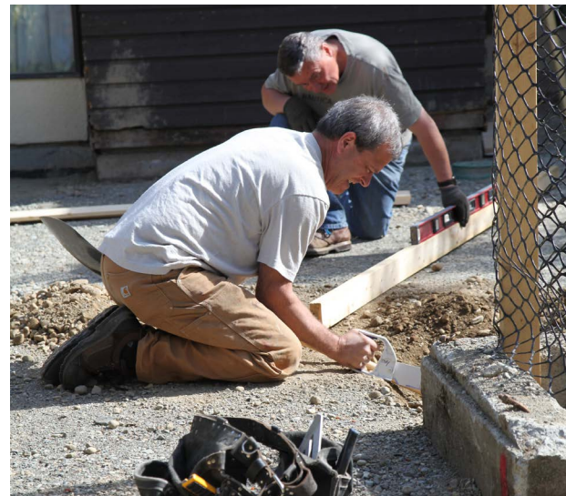
Island Health staff working on the Acute Care Patio Upgrade

for information or to sign up, please call 250-538-4824 visit our website at: www.ladymintofoundation.com Email: Karen.Mouat@viha.ca