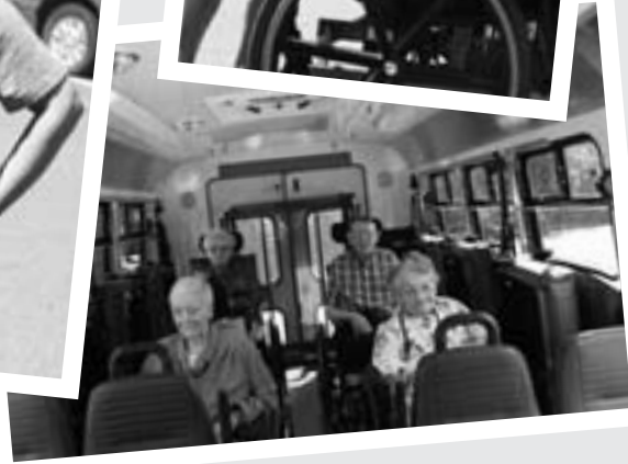
Extended Care Excursion Day Program (initiated November 2008)

Donors who have given to the Foundation between April 1, 2008 and March 31, 2009